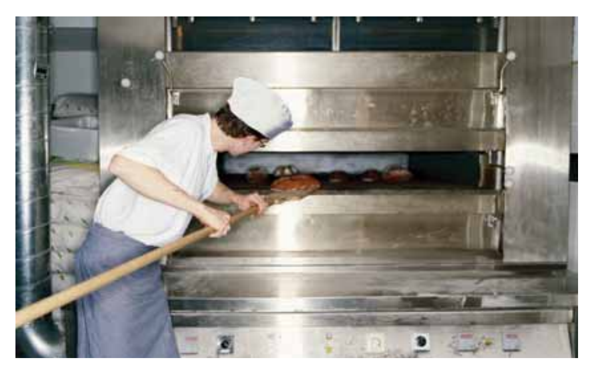
Dual Baking Deck ovens are used in high-volume baking to cook a variety of products at once. Where would you most likely find deck ovens?

A convection oven has a fan that circulates the oven's heated air. This fan allows you to cook foods in about 30% less time and at temperatures approximately 25° to 35° lower than temperatures in a conventional oven. Convection ovens range in size, and are available in either gas or electric models.